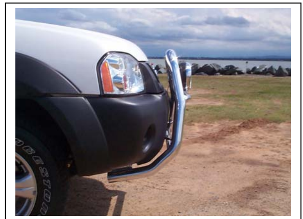
Figure 4 – Series 2 Nudge Bar