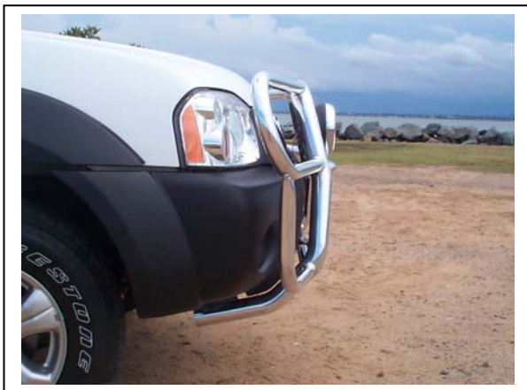
Figure 3 – Type 8 side view